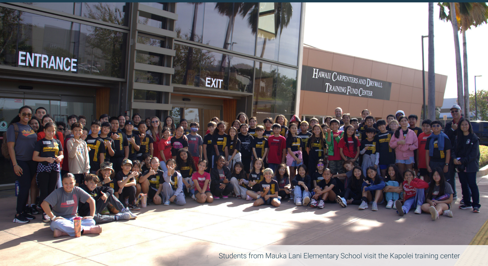
Students from Mauka Lani Elementary School visit the Kapolei training center

Kauai | Oahu | Molokai | Lanai | Maui | Kona | Hilo