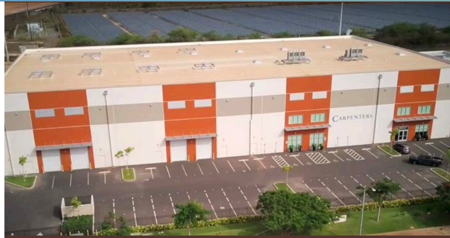
HCATF's state-of-the-art 2090 Training Center is the first - and only - millwright training facility in Hawaii.

The millwright apprentices of HCATF are playing a key role in the state's renewable energy projects, contributing significantly to both environmental stewardship and